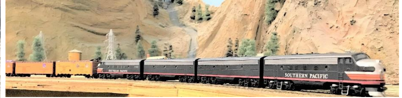
F7 ABBA fruit express

The Southern Pacific was an American Class I railroad network that existed from 1865 to 1996 and operated largely in the Western United States. The Southern Pacific railroad was a significant contributor to the history and growth of California. Come see the history come alive.